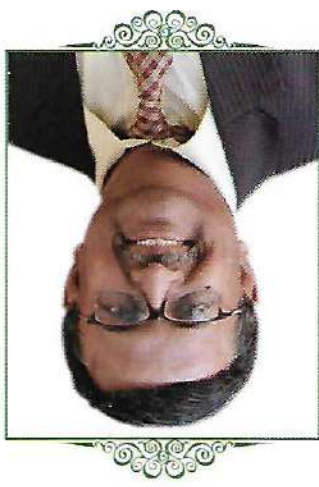
Message from the Principal